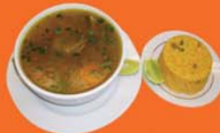
Sopa de Res