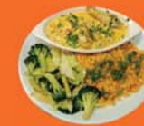
Pollo en Crema