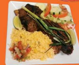
Costilla de Res Asada