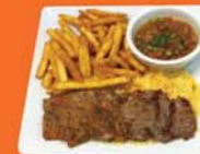
Asada a la Tampiqueña

* Prices Subject to change without previous notice. * A 15% gratuity will be automatically added for parties over 6 people. * Un 15% de propina sera agregado a la cuenta de grupos de 6 o mas. * Add Local Tax to all prices.