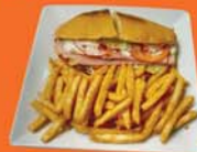
Torta de Jamon