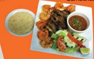
Mar y Tierra