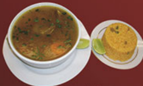
Sopa de Res