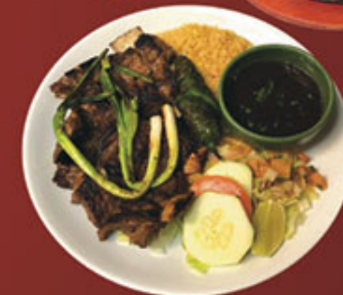
Costilla de Res Asada