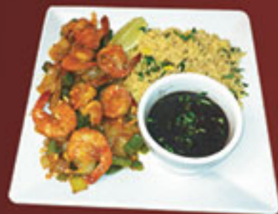
Camarones al Ajillo