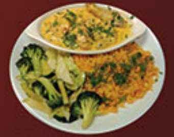
Pollo en Crema