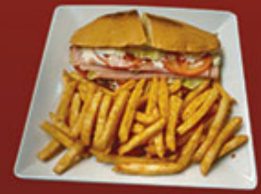
Torta de Jamon