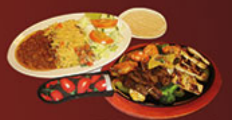
Fajita a la Antigua