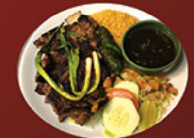
Costilla de Res